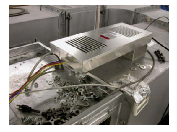
Figure 2-1. Ballast box installed on the outside of the test rig.

Table 2-1 provides information on the system as supplied by the vendor. Figures 2-1 and 2-2 provide views of the device as tested, installed in accordance with the manufacturer's specifications.