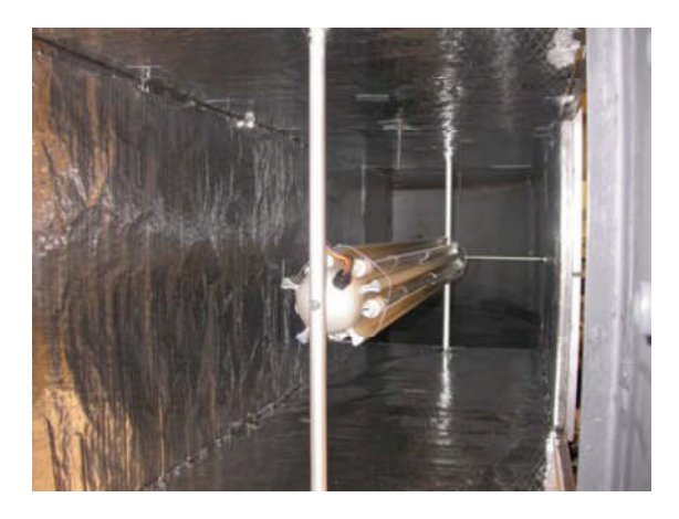
Figure 2-2. Device installed inside the test rig. There are 5 lamps. A reflective surface was placed in the duct.

Figure 2-1. Ballast box installed on the outside of the test rig.